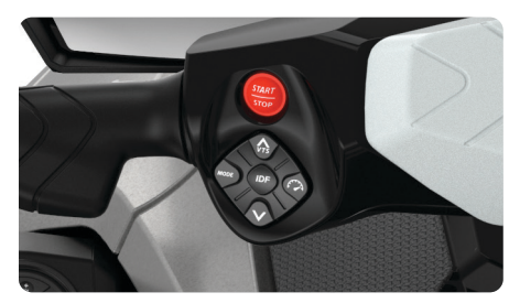
iDF - Intelligent Debris-Free Pump System

The industry's first manufacturer-installed truly waterproof Bluetooth<sup>†</sup> audio system.