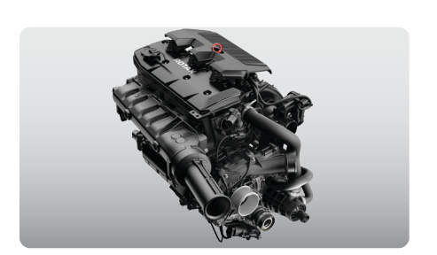
Rotax® 1630 ACE™ - 300 Engine

An innovative, industry-first system that allows you to free your pump of weeds and debris with intuitive handlebar-activated controls.