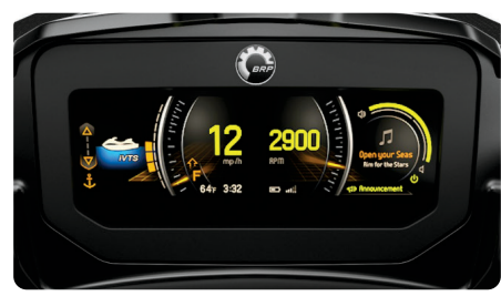
Full-Color 7.8" Wide Display

An innovative hull that sets the benchmark for rough water handling, stability and offshore performance.