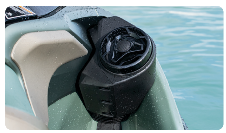
BRP Audio - Premium System

USB port, watercraft cover, storage bin organizer, knee pads, exclusive coloration and more.