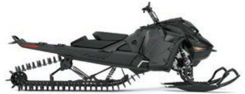
SUMMIT EDGE 165 850 E-TEC SHOWN

This high-end in-season package is loaded with proven technical features.