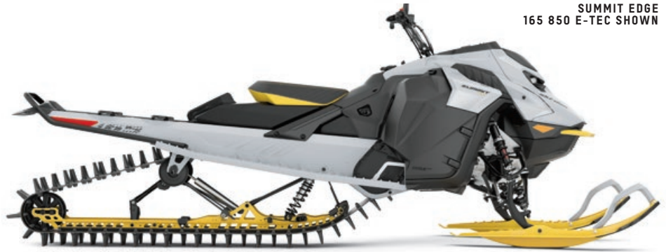
SUMMIT EDGE 165 850 E-TEC SHOWN